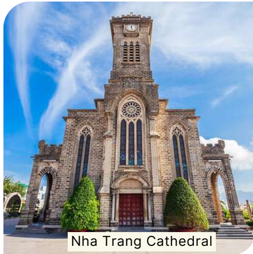
Nha Trang Cathedral