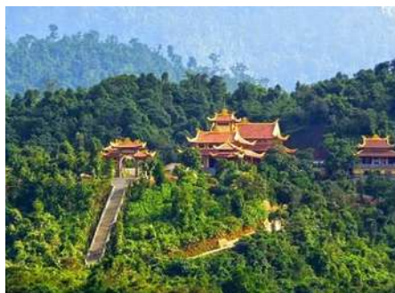
Truc Lam Monastery