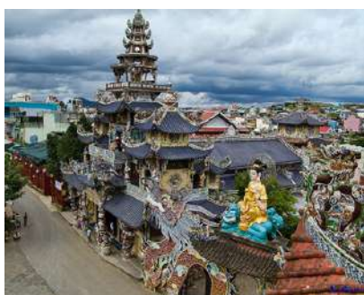
Linh Phuoc Pagoda