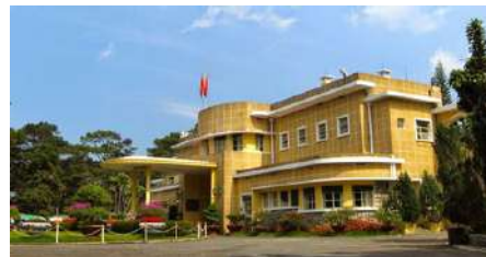
King Bao Dai's Palace