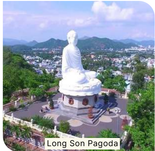
Long Son Pagoda