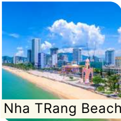
Nha Trang Beach